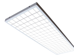
Door frame and wire guard