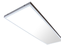
Door frame and lens